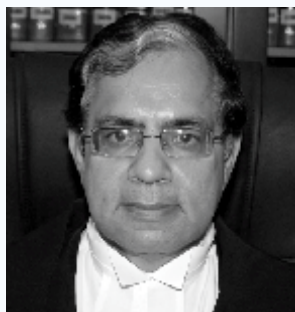
Justice A.K. Sikri Former Judge, Supreme Court of India (Chair)