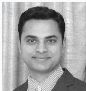
Dr. K.V. Subramanian Chief Economic Advisor, Government of India