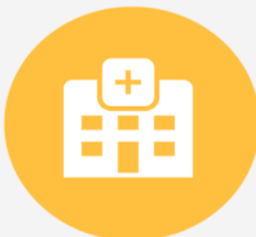
VK NRL Hospital