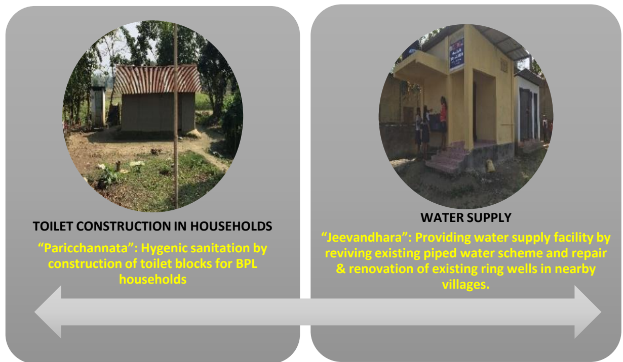
Image 6 Sanitation Projects