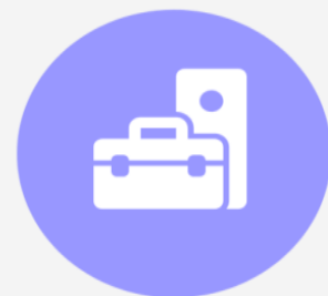
Handloom Weaving centre, Piggery, Dairy and Goatery